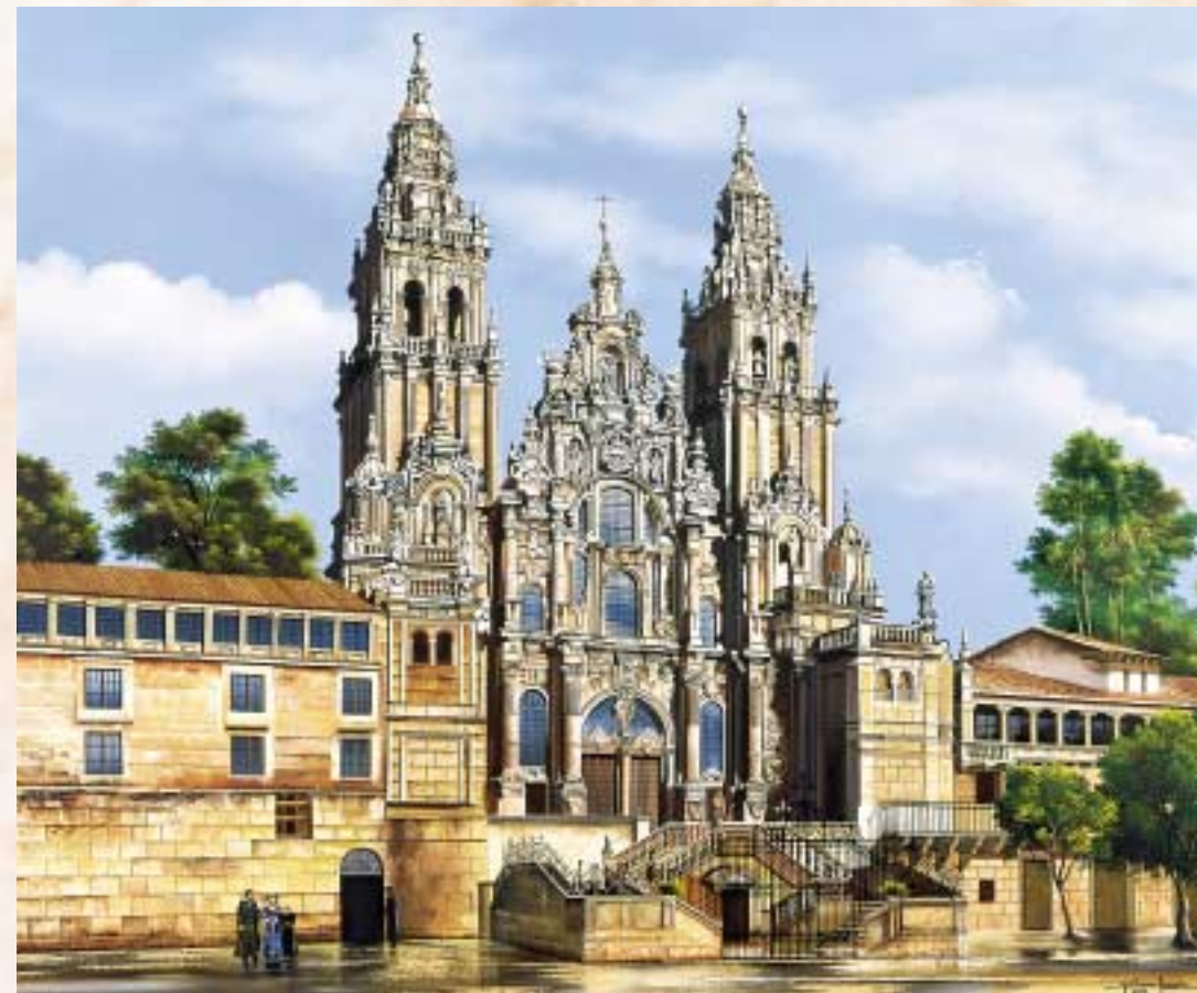
The Cathedral of SANTIAGO de Compostela