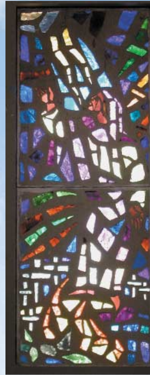
I walk through the valley of the shadow of death. . .

I, the sheep, will let go of my tendency to feel and believe the worst