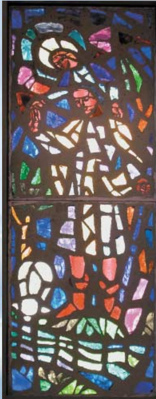
He leads me beside the still waters. . . .

Manufactured by BRG Carillon Bell Systems, Inc., the carillon is capable of sounding nearly 2,000 hymns, bells, tolls and classic chimes, to sound the time.