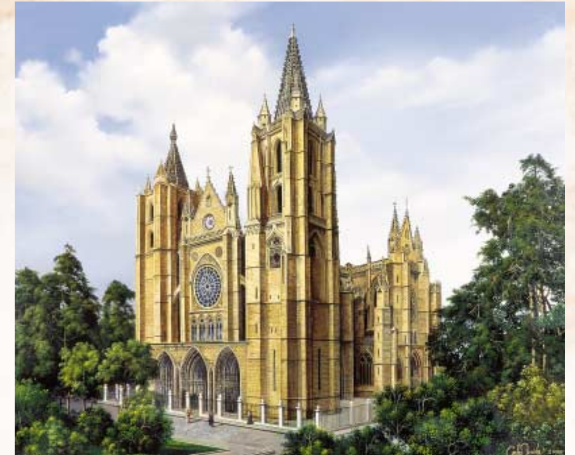
The Cathedral of LEON