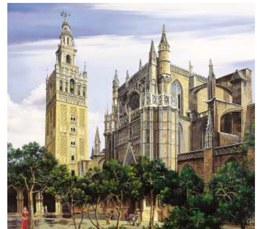
The Cathedral of SEVILLA & Giralda Tower

Alhambra Towers is an endeavor to continue in this legacy and usher in a new renaissance in Coral Gables.