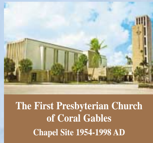
The First Presbyterian Church of Coral Gables Chapel Site 1954-1998 AD