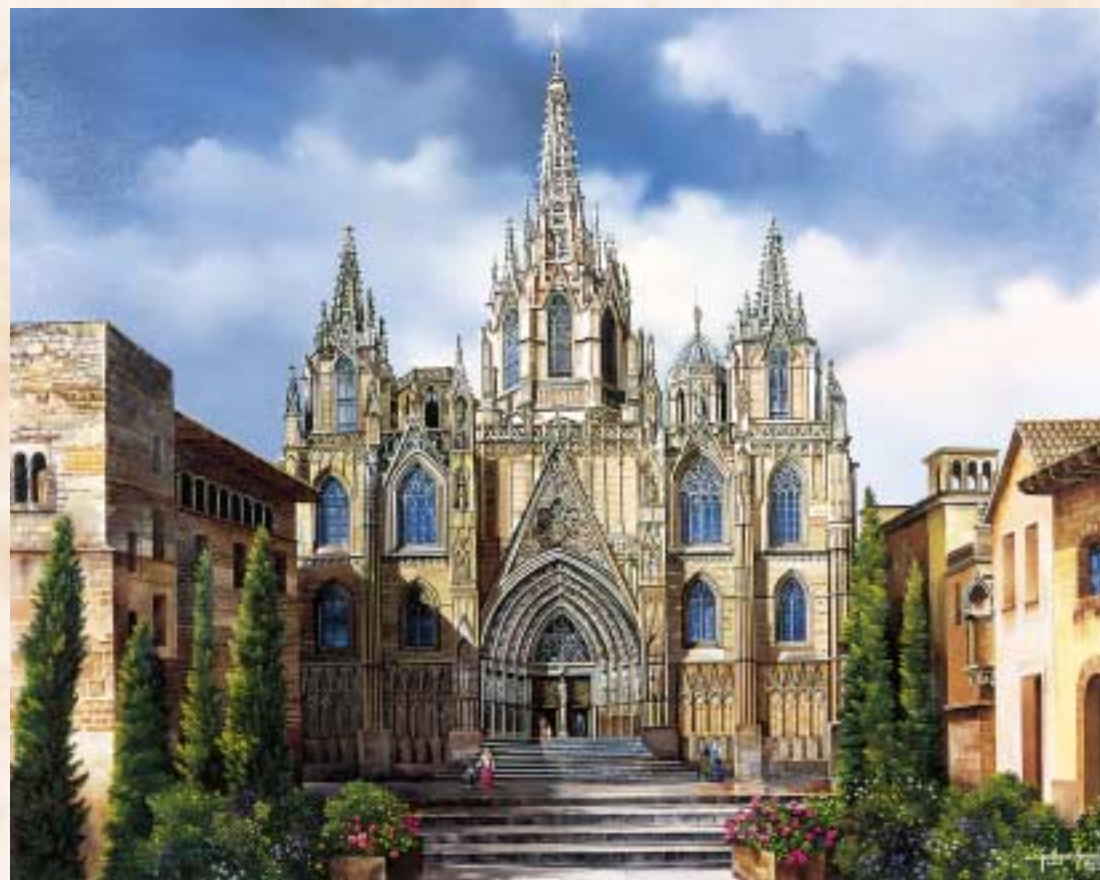
The Cathedral of BARCELONA