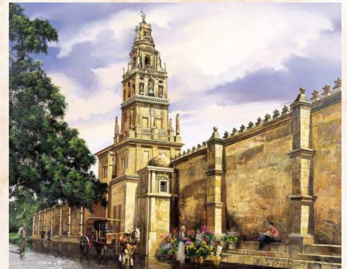
The Cathedral of CORDOBA