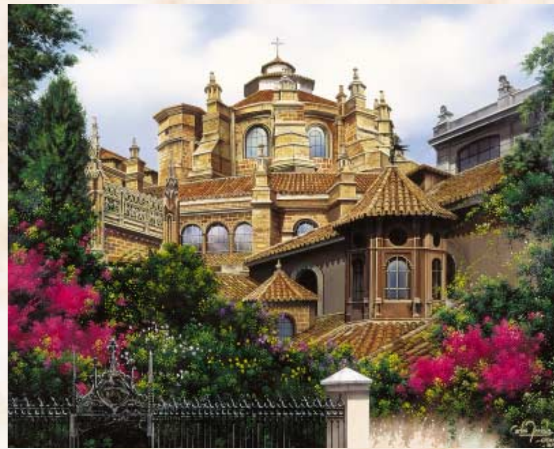
The Cathedral of GRANADA