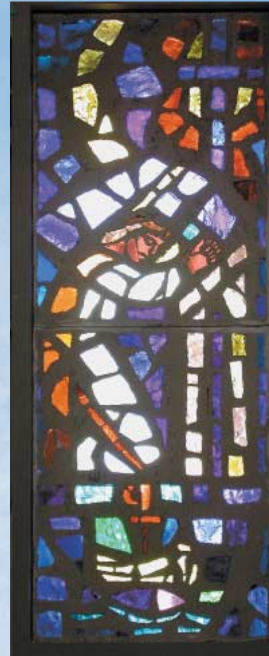
You anoint my head with oil. . .