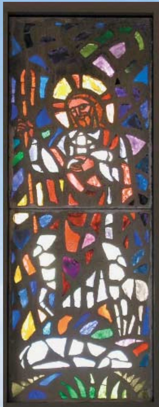
The Lord is my Shepherd. . .

When we surveyed and measured all of the stained glass windows, we noticed that these were the only windows which would fit in the new Building.