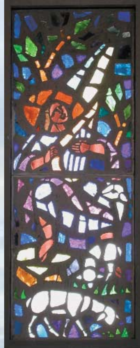
Surely goodness and mercy will follow me. . .